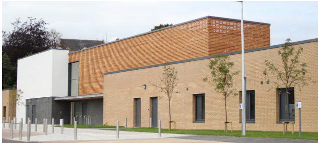
LEVERNDALE HOSPITAL, GLASGOW

Abbotsford required major refurbishment and updating, following the death of Sir Walter Scott's last remaining descendent. King Communications & Security provided a complete IP CCTV solution, Salto Access Control and an Intruder Alarm system that all efficiently linked together to enhance the security and longevity of Abbotsford's maintenance.