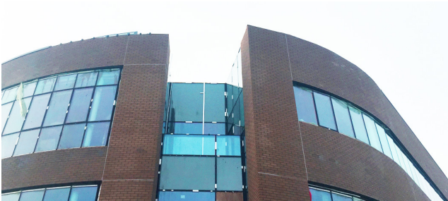
SIR CHARLES LYELL CENTRE, EDINBURGH

Heriot-Watt University and the British Geological Survey wanted to create a leading Research Centre where new systems were supplied to cope with a wide range of environmental/operational demands. Bespoke fire, cabling, access control and security systems solutions were devised to meet the project's unique criteria.