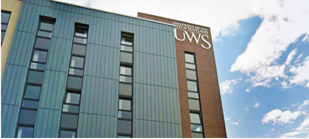
UNIVERSITY OF THE WEST OF SCOTLAND, PAISLEY

The client required multiple system solutions including deaf alert paging for the protection of students at this luxury city centre student accomodation. We delivered intelligent fire alarm systems, integrated CCTV, Access Control, Door Entry, Data/Fibre and more, covering foundation building system infrastructures for the project.