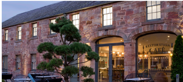
DALKEITH COUNTRY PARK, EDINBURGH

Heriot-Watt University and the British Geological Survey wanted to create a leading Research Centre where new systems were supplied to cope with a wide range of environmental/operational demands. Bespoke fire, cabling, access control and security systems solutions were devised to meet the project's unique criteria.