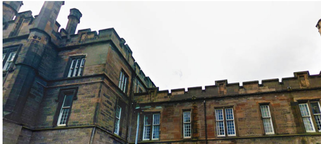
GARTNAVEL HOSPITAL, GLASGOW

King Communications & Security provided an integrated Guardian Staff Safety and Nurse Call System across the Leverndale Hospital campus which utilised existing network infrastructures. The solution simplified and streamlined the hospital's assistive technology whilst including solutions for Door Entry and Disabled Toilet Alarms.