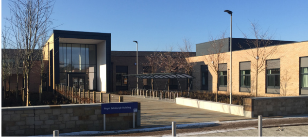
ROYAL EDINBURGH HOSPITAL, EDINBURGH

Working with appointed contractor Balfour Beatty, King Communications & Security supplied access control, IP CCTV, intruder alarm system and more to the refurbishment project. A comprehensive Fire System was also required to protect the museum's historic archives, sporting and leisure facilities in the building's busy public spaces.