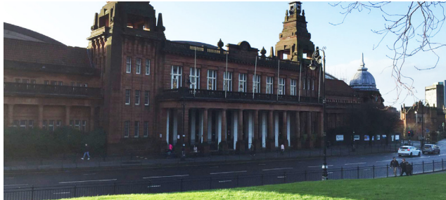
THE KELVIN HALL, GLASGOW

Over 50 security cameras were installed across the 1,000-acre estate at Dalkeith. The site required a centralised security system to manage access control and door entry system, IP CCTV and video management. The 18th Century facility, owned by the Duke of Buccleuch, is now home to a visitors kiosk, shops, cafe and children's play yard.