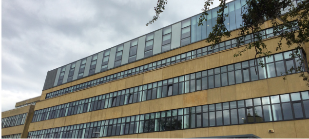
CLIFTON & STEWART HOUSE, GLASGOW

We delivered a Fire Alarm and Aspirating Smoke Detection System to the NHS Lothian, Royal Edinburgh Hospital £48 million phase one redevelopment project. Our solutions offered comprehensive coverage to sensitive mental health environments, utilising Notifier by Honeywell multi criteria detectors to minimise false alarms.