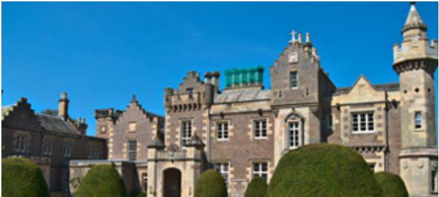
ABBOTSFORD HOUSE, GALASHIELS

UWS wanted to link CCTV for their Ayr and Paisley campuses whilst giving high quality/clarity pictures to the security control room. Utilising Milestone Video Management solutions, we created centralised solutions for the facility which supports over 20,000 students. Cost saving measures were also enabled through use of existing infrastrucutres.